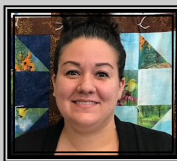
Tessa Stacy Infant Toddler Mental Health